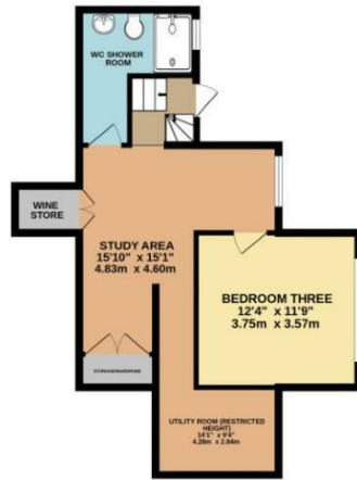
LOWER GROUND FLOOR 519 SQ.FT. (48.1 SQ.M.) APPROX.