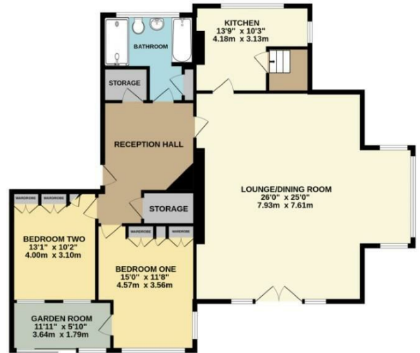
GROUND FLOOR 1335 SQ.FT. (124.1 SQ.M.) APPROX.